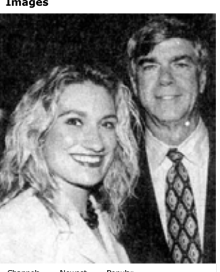
Channels Newest Popular